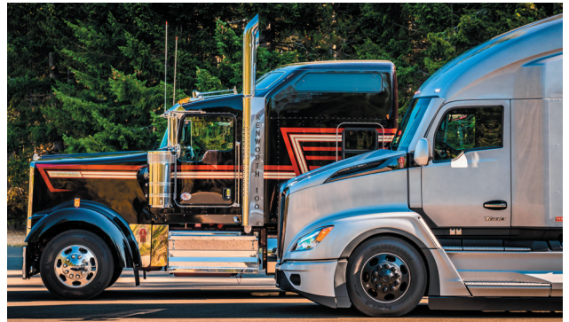
88U60 - 22.5"