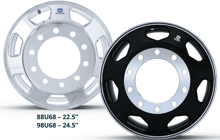
88U68 - 22.5" 98U68 - 24.5"