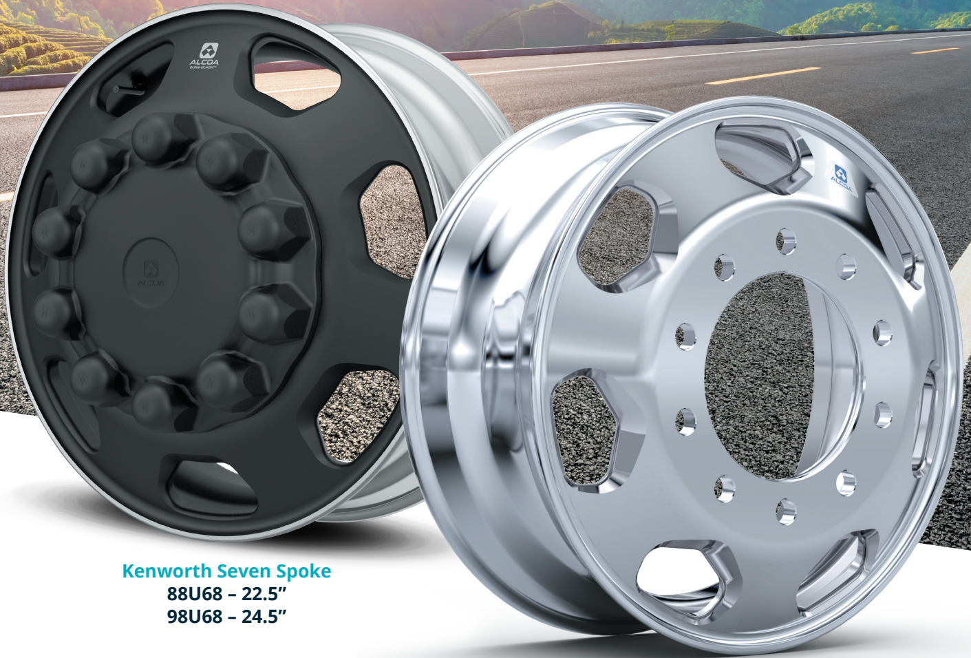
Kenworth Seven Spoke 88U68 - 22.5" 98U68 - 24.5"