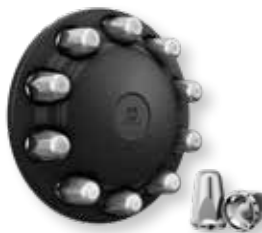
MATTE BLACK WITH CHROME NUTS